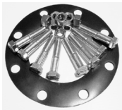
Flange Packs Plated