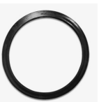
MJ Gasket SDR