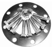
Flange Packs Stainless Steel