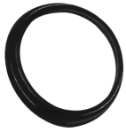
MJ Gasket SBR