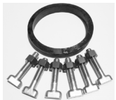
Stainless Steel Bolt Pack /w MJ Gasket