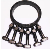
Standard Bolt Pack with MJ Gasket