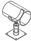
Saddle Support Standard