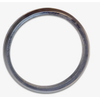
MJ Gasket IPS Transition