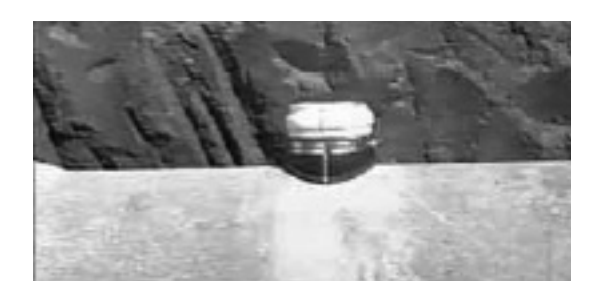
STEP 8 Install side service pipe in normal manner.

Place the stainless steel band around the top of the rubber sleeve and tighten down.