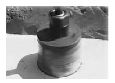
STEP 1 Make sure bit is perpendicular to mainline. Core the proper size hole. Feel inside hole and clear any remaining material.