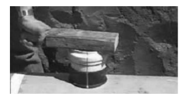
STEP 5 Place the 2x4 board onto the top of the PVC hub adapter