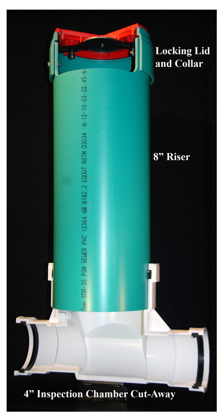
The PVC Inspection Chamber was developed because of a recognized need for Municipalities to have easy access to their storm and sanitary service lines.