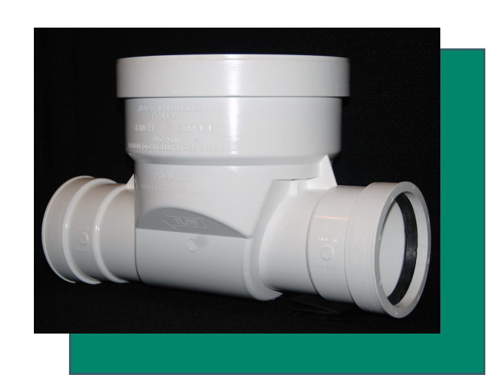
4" Inspection Chamber *Pro-Lines 4" & 6" IC's are molded to DR26 heavy wall.